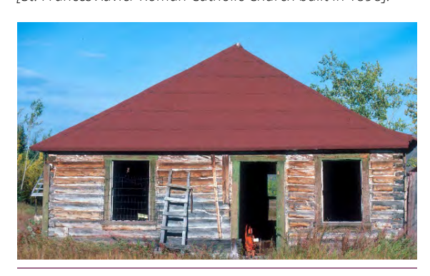
Coward Garage. 2005