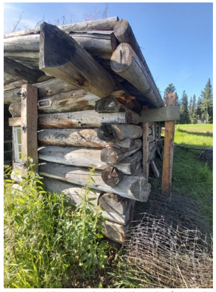
Stabilizing Coward's Machine Shop sod roof retaining log