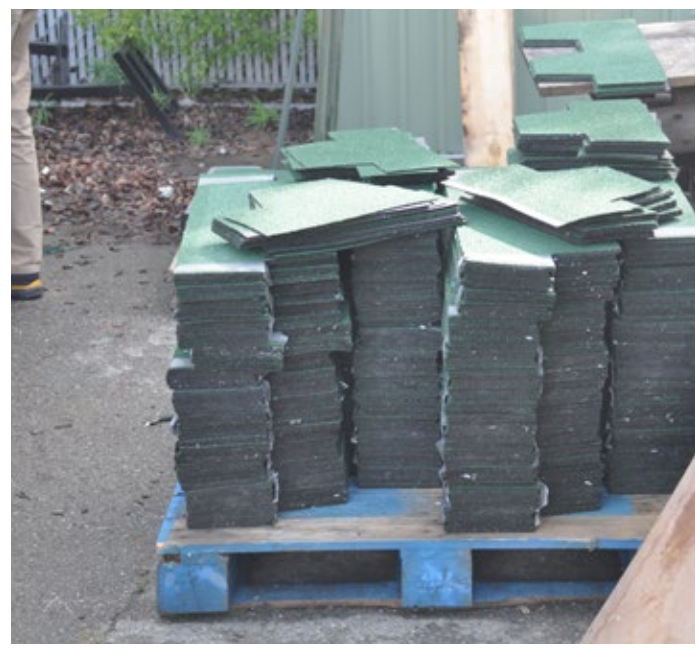
Above and below: Cutting the shingles