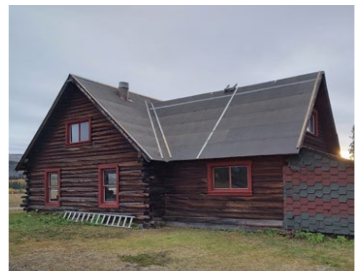
Stone House roof at end of 2020 season

Like much of the Yukon, the weather at Fort Selkirk this summer was much wetter and cooler than usual. The cool, wet weather meant that much more firewood had to be cut for the campground and work camp. The Pelly and Yukon Rivers were running very high for much of the season, however, erosion monitoring at Fort Selkirk this year did not show any significant increase in bank erosion.