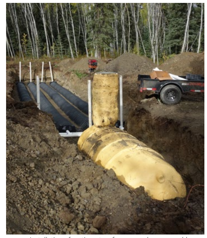
Installation of septic system for new work camp washhouse.

Construction of the new work camp washhouse started this year, with the installation of the septic system. In May, archaeologists performed test excavations at the work camp to ensure that the new septic field would not impact any cultural resources. Trees and brush in the southwest corner of the work camp were cleared to make room for the excavation equipment to operate. An additional excavator and plate compactor were brought in by boat, along with the septic tank and other building materials. The septic system was installed in early September and a permit to use the system has been issued. Construction of the washhouse is slated to begin next season.