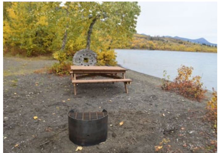
Picnic area and fire pit