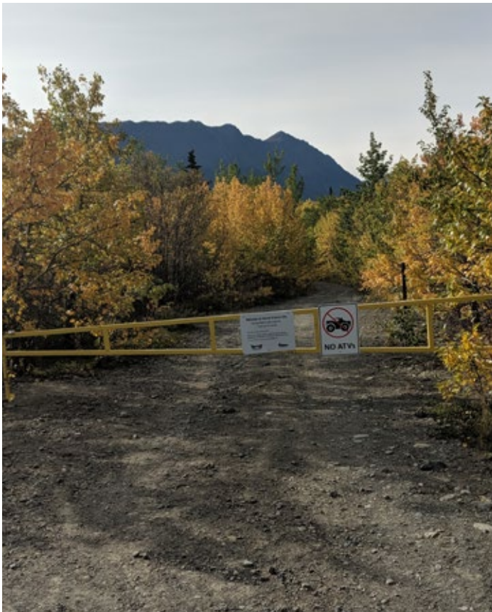
Conrad Historic Site, North access gate

To preserve the heritage resources at the site, a locked gate was installed in July 2016 making the site closed to vehicle access, except for service vehicles. The site remains open to the public via walk-in access from May to October. The gate is unlocked from September to May.