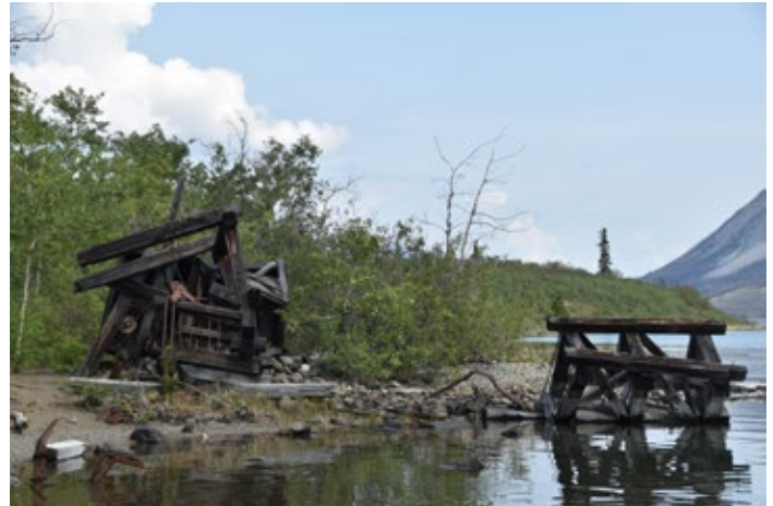
Conrad Tram Terminal