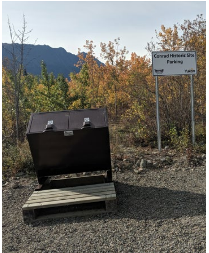
Conrad parking area