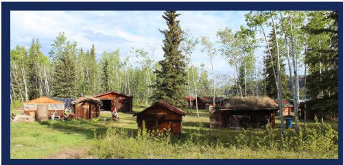
View of the Work Camp from the edge of the Campground.