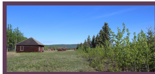
View of the Orderly Room.