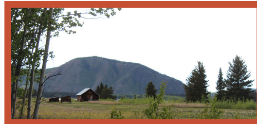
Distant view of Big Jonathan House and Cache.