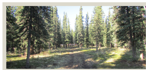
View of the trail leading to the Selkirk First Nation Burial Site.