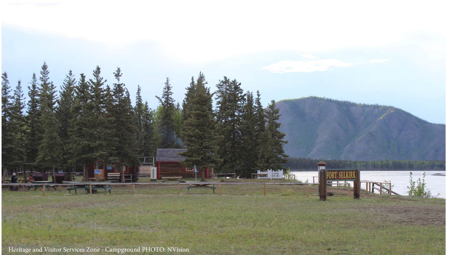
Heritage and Visitor Services Zone - Campground