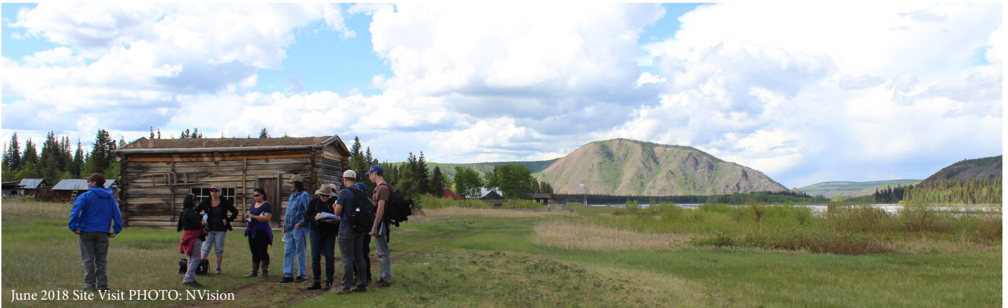
June 2018 Site Visit