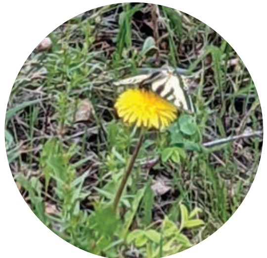
This Old-world Swallowtail followed the group along the trail tour.

You can find the new trail at the Conrad Campground beside the Conrad Historic Site, which are both within the Traditional Territory of Carcross/Tagish First Nation.