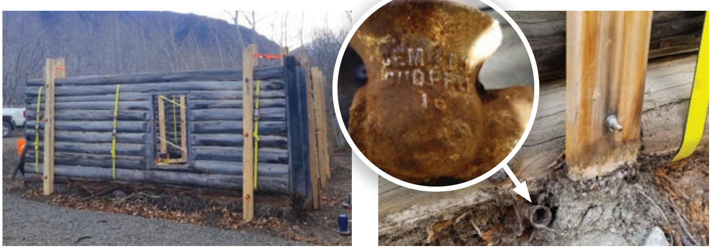
NW corner looking south prior to the lifting process, getting ready to place the jacks. Sandwich bracing is in place.