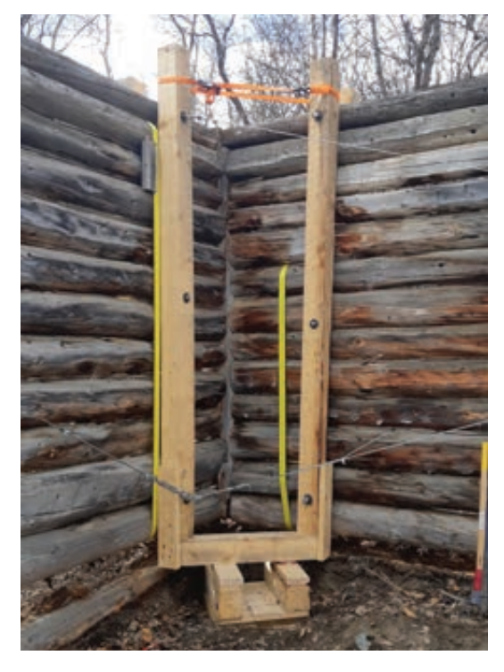
Interior view of SW corner, after lift. Sandwich bracing with cribbing in place.