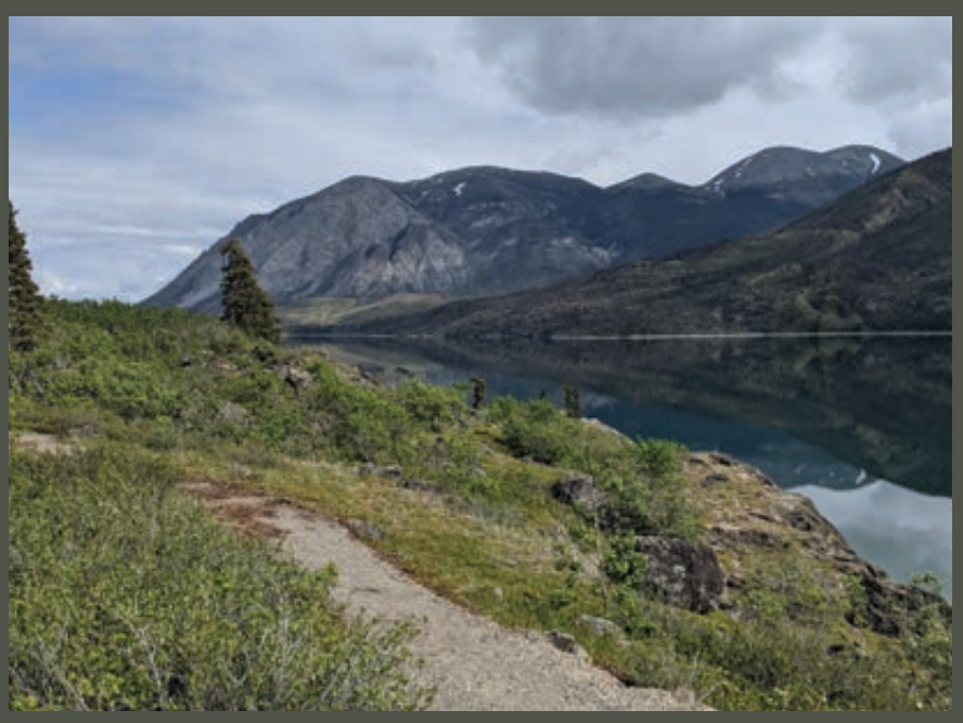
Trail overlooking Tséi Zhéłe Méne' (Howling Rock Lake) Windy Arm.