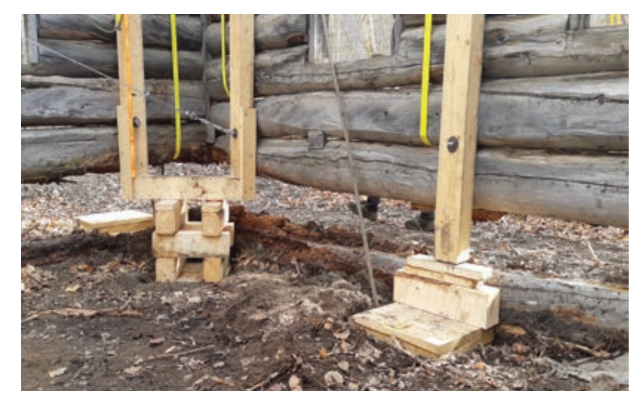
Approximately 18" lift on the highest corner.