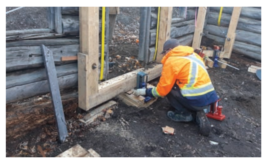
Approximately 18" lift on the highest corner.